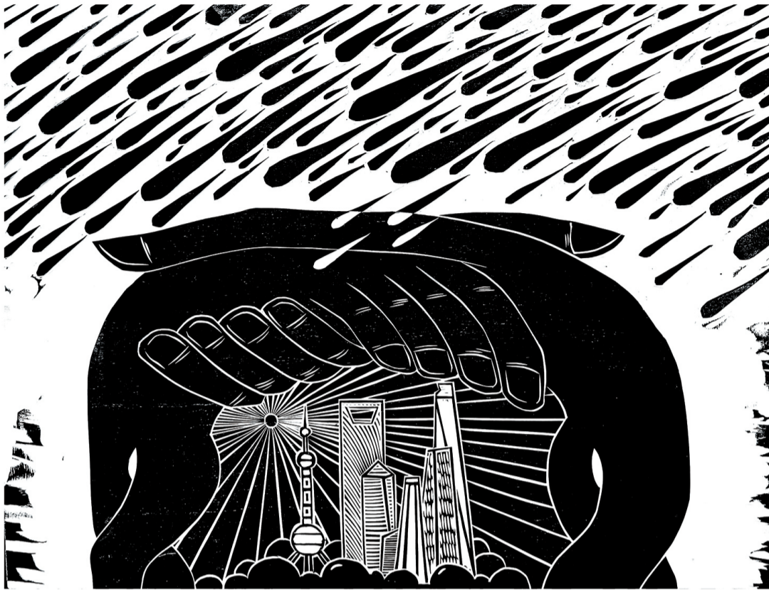
Left: "Shou Hu"