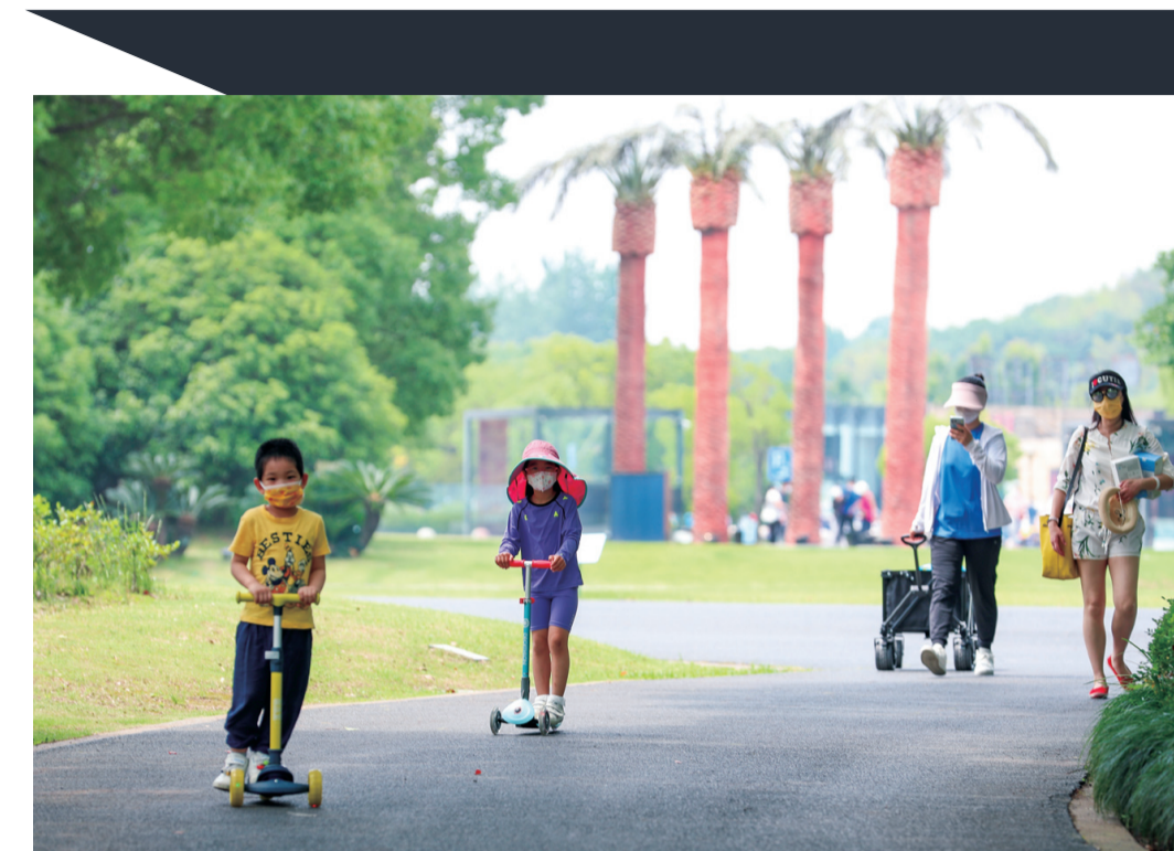
Left: Tourists enter the Chenshan Botanical Garden; Above: Children ride scooters at the Shanghai Yuehu Sculpture Park.