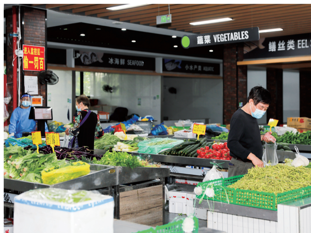
People shop at a local wet market.

"Traffic peak in the morning occurred at around 8am," said Wu. "Traffic flow has returned to 50