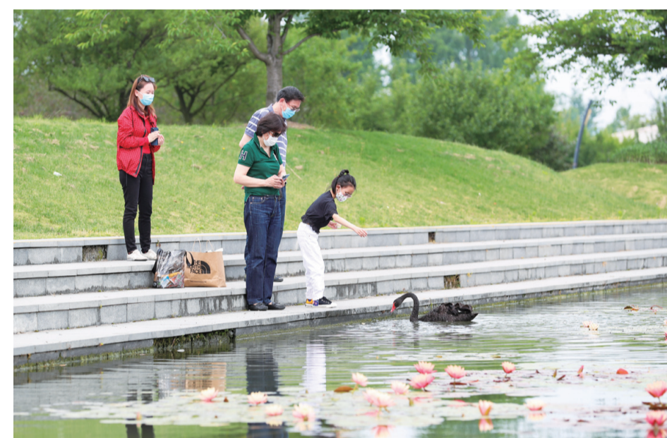
A black swan attracts a group of tourists at the Chenshan Botanical Garden.