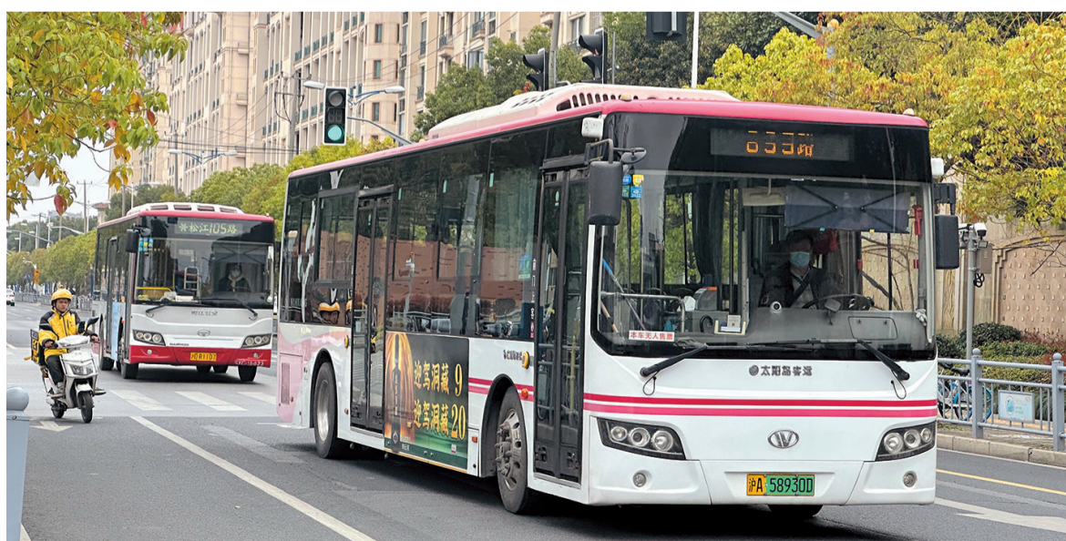
Buses run on a street in Sijing Town to carry commuters from Metro Line 9 to the local communities.

When put into full operation around the year's end, the bus center will improve the level of public transportation facilities along Metro Line 9, better meeting the public's travel needs.