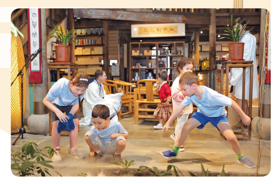
Children have a good time during the Mid-Autumn Festival gathering.

"The environment in Jiading is very pleasant, with abundant greenery and parks. Working in the district is also convenient," he said. "I registered on an app to work here; it provided comprehensive details