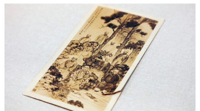
The "Nine Elders of Jiading" depicts a gathering of literati in Qiuxiapu Garden on the Double Ninth Festival in 1936.

The Jiading Museum provides various activities to enhance the experience of visitors. They can learn about the garden's history and culture from the exhibition and immerse themselves in the Jiangnan-style garden.