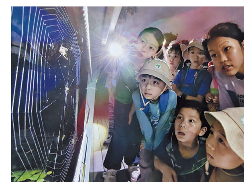
Children gaze curiously at the plants and small animals at night.